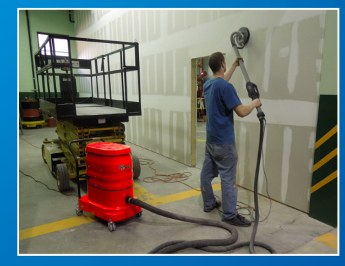
CONSTRUCTION DUST REMOVAL