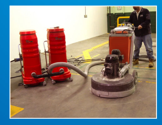
VACUUM ASSIST TOOLS FOR SILICA DUST REMOVAL