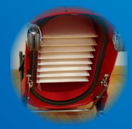
Oversized filtration efficiently removes large quantities of dust