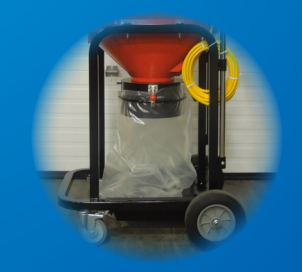
Direct bagging safely collects contents and is easy to dispose. Optional LongoPac is available!