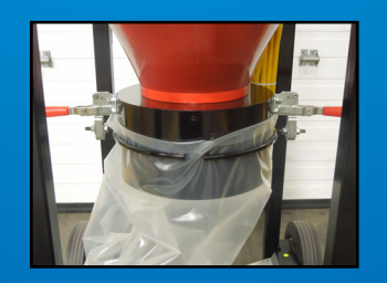
Attaches in 3 easy steps!