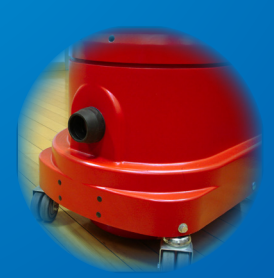
Low inlet for easy portability and prevents tipping