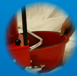
Foot-actuated dustpan makes emptying easy and dust-free